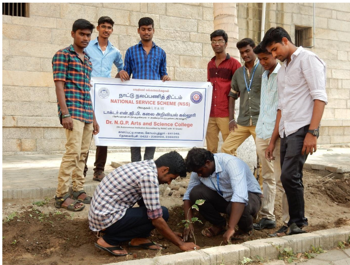
A Mass Tree Saplings Plantation event conducted on 17.12.2016 at Government Primary School, Kalapatti