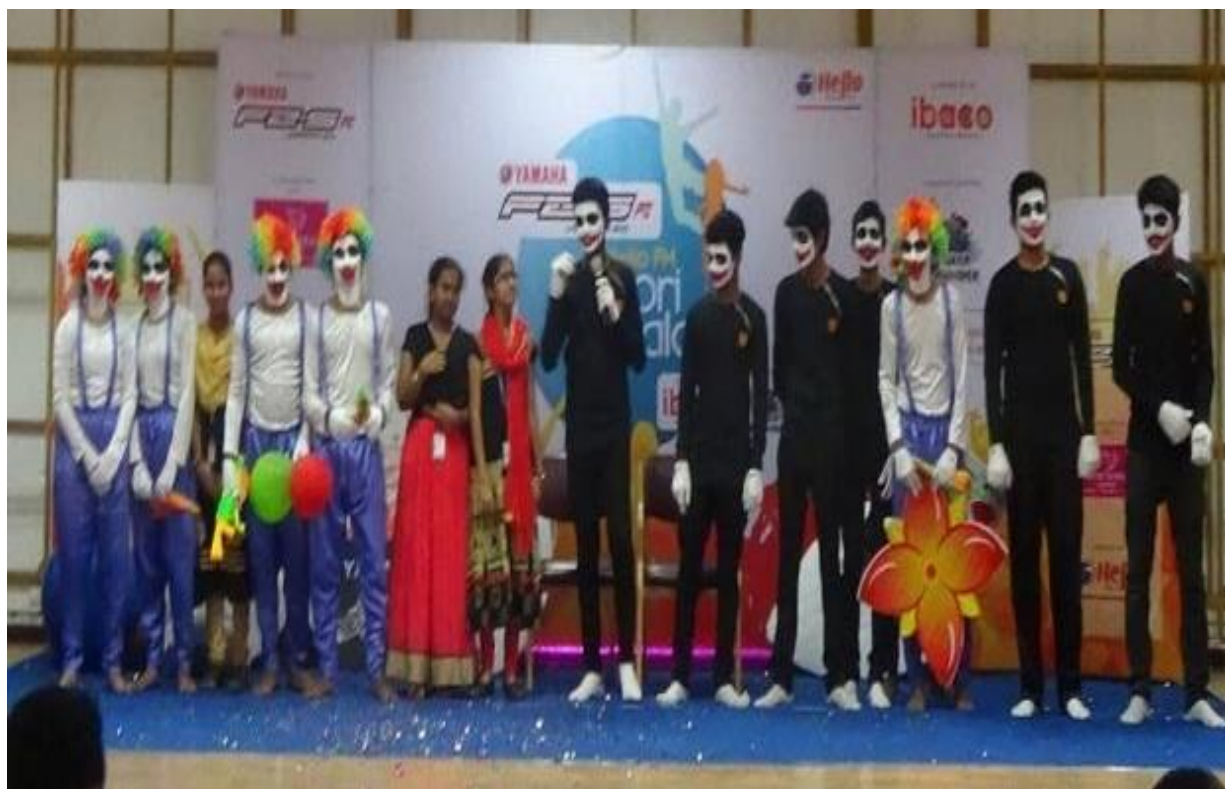
Hello FM Kaloorisalai on 4.01.2017

A significant initiative to encompass students with local arbitrary learning and exposure, Hello FM Kaloorisalai was conducted and the grand final contest held on 4 th January 2017. Our college students participated and won second place with cash prize of rupees 15,000.