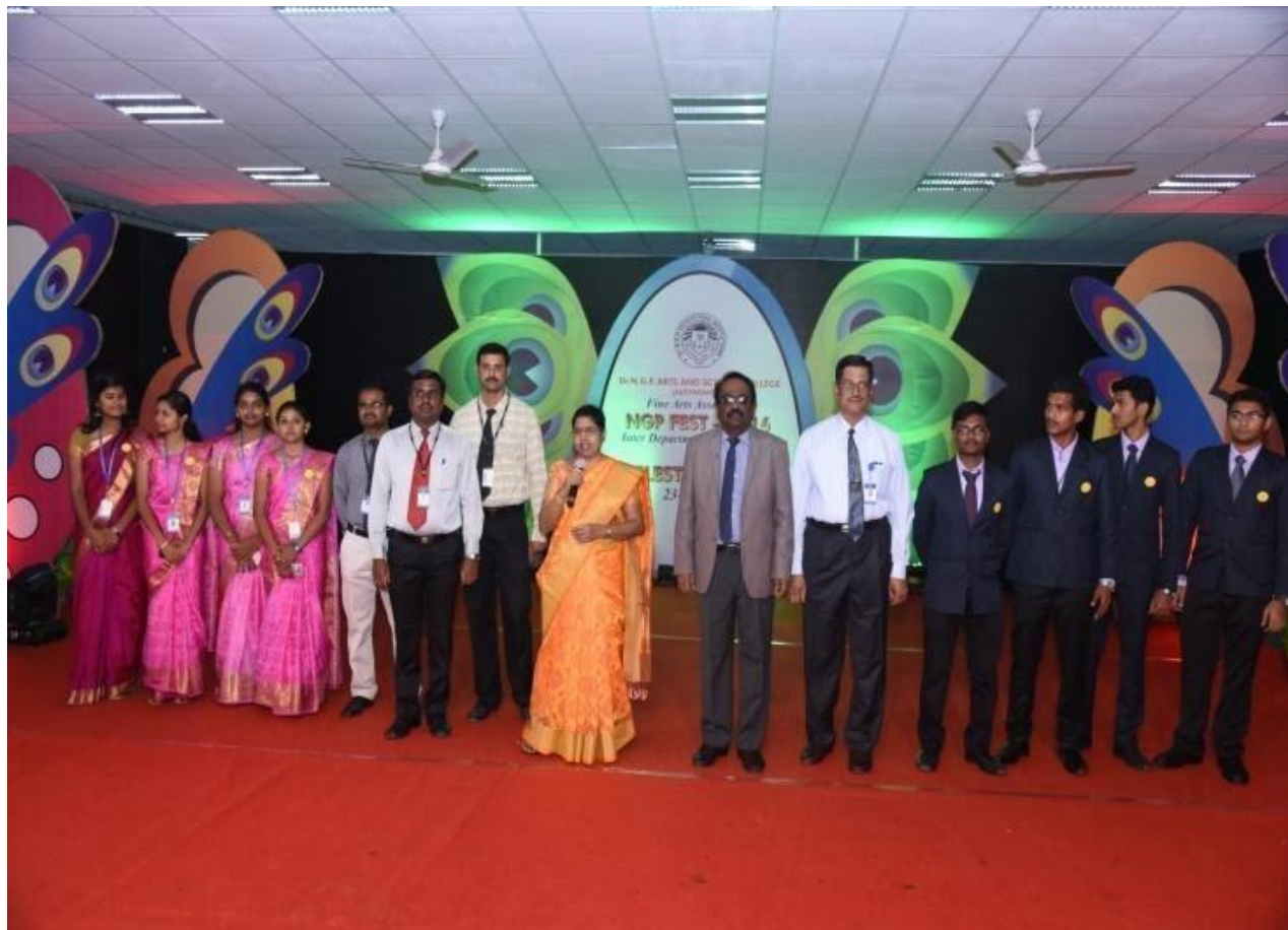
Prize Announcement moment NGPFEST on 23.12.2016