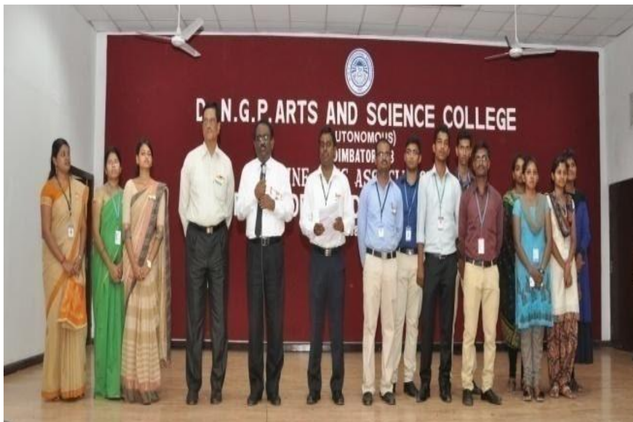
Independence Day Celebration on 15.08.2016