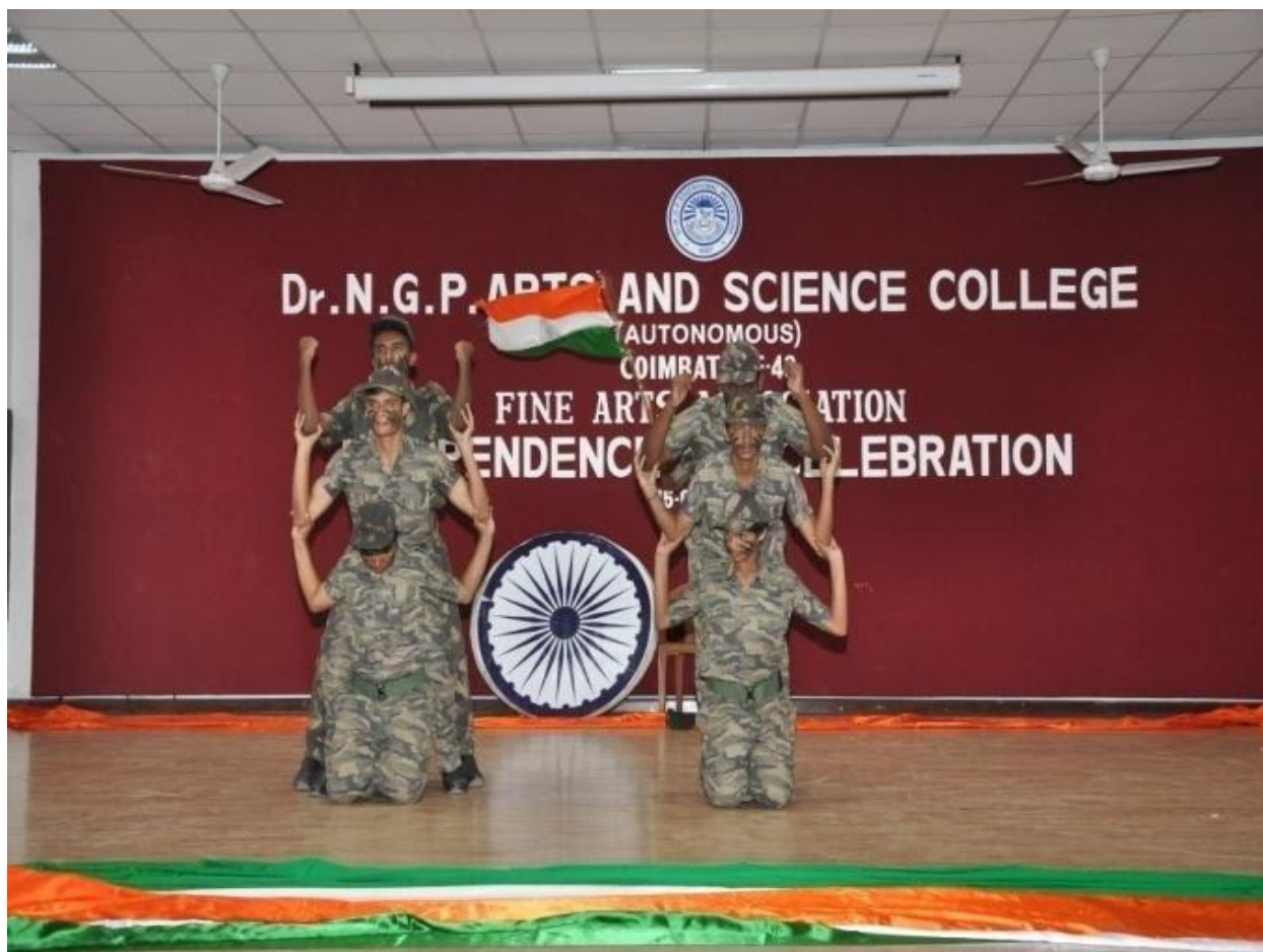
Independence Day Celebration on 15.08.2016