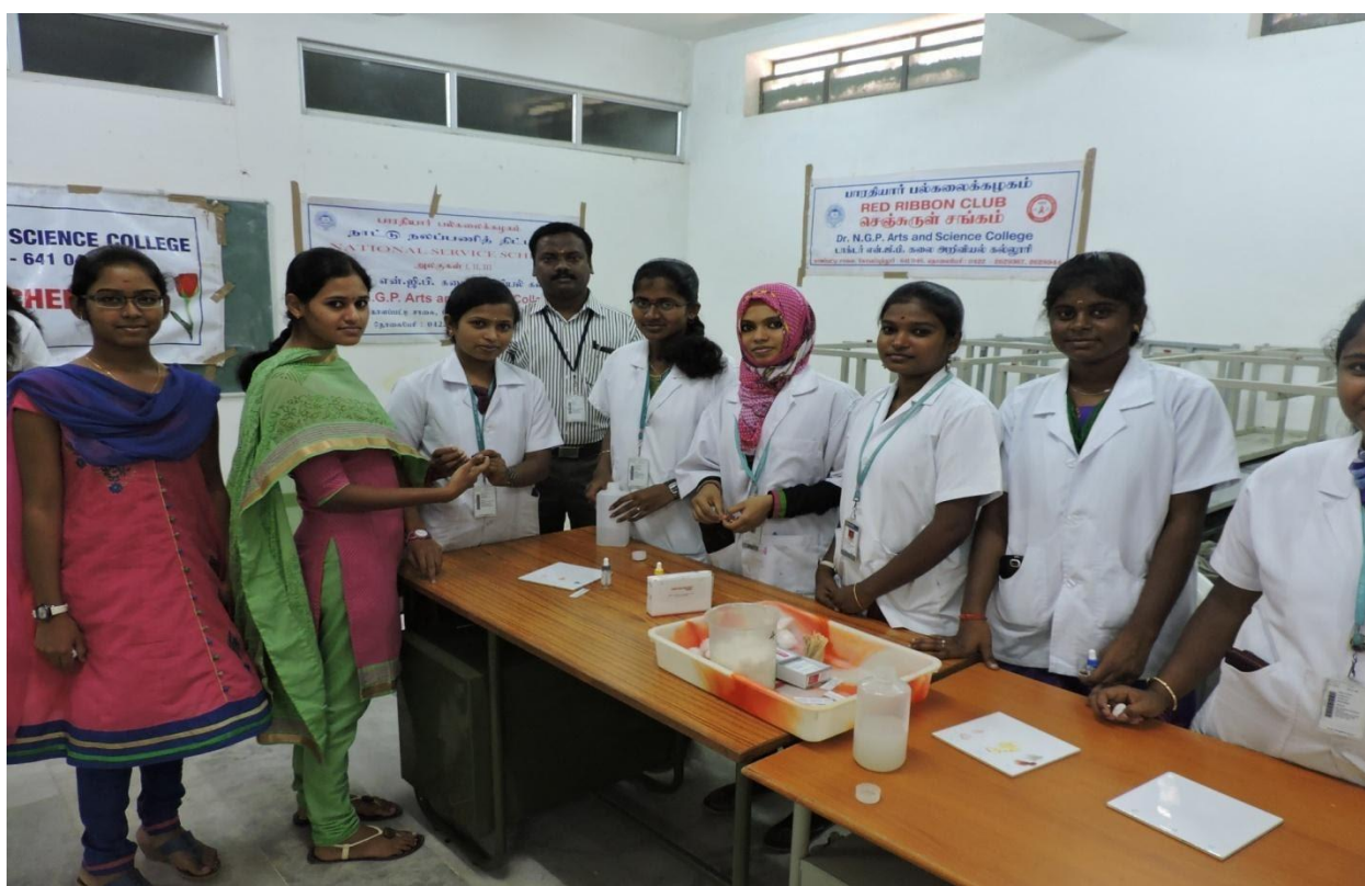
First Aid and Women Empowerment event conducted on 11.1.2017 at Kalapatti, Veeriyampalayam, Karupparayampalayam