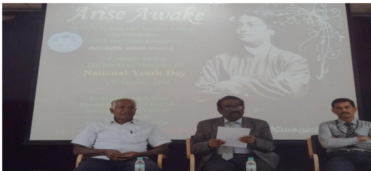
National Youth Day Celebration on 12.01.2017