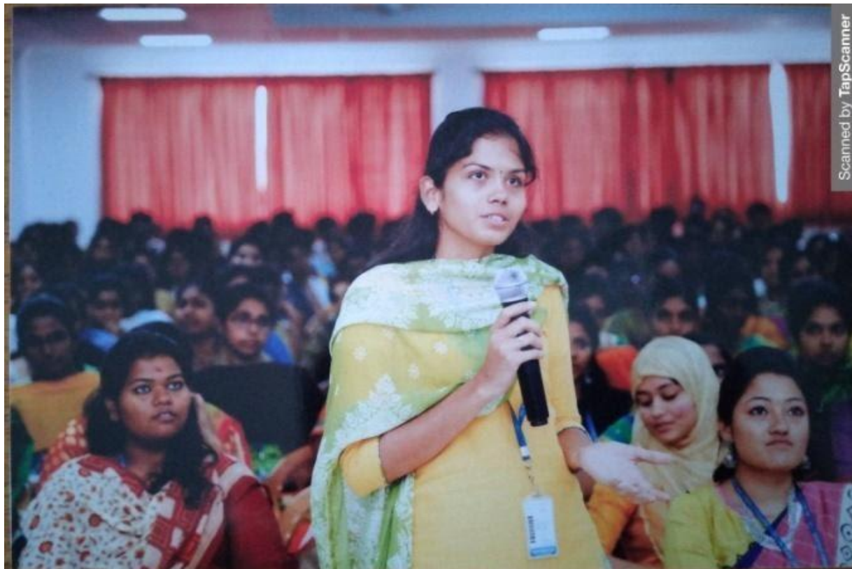
Pre-Marital Guidance at Kambar Arangam on September 6, 2016