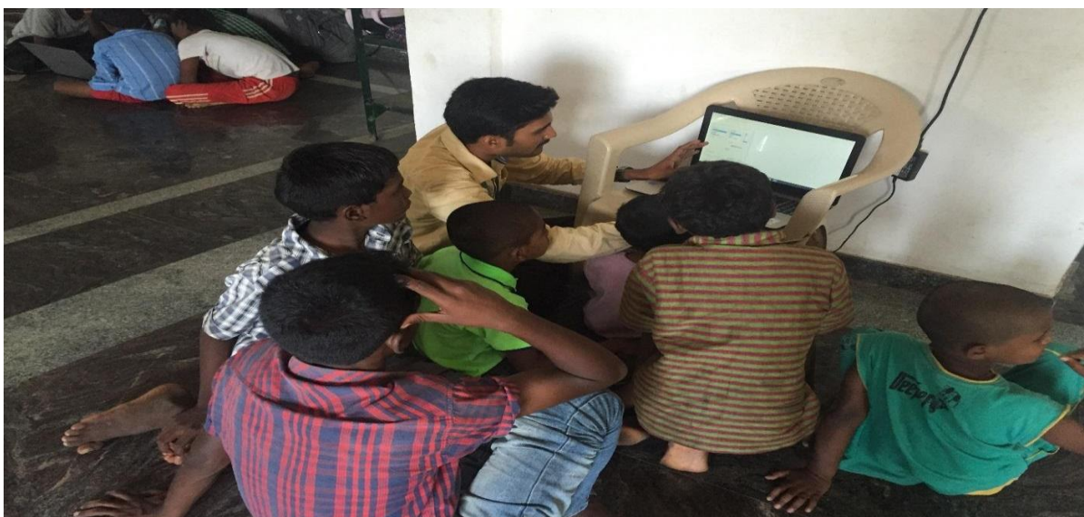
Students educating basic computer activities to the children's in Aravanaikkum Anbu Illam

On behalf of the Bloggers Association, Department of Computer Applications organized an Extension Activity on Basic Computer Literacy at Aravanaikkum Anbu Illam, Thanner Pandhal, Peelamedu on 20 th August 2016. The students of BCA and 2 faculty members were given lecture on basic of computers.