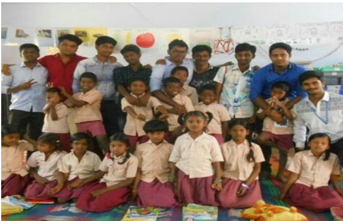
I BSc food science and nutrition students participated in organizing a field work recent nutritional moves and transition on 21.02.2017

In collaboration with G-18, a public charitable trust along with Gandhian department, PSGR Krishnammal college are jointly conducting a workshop Paarvai on 21 st February 2017. They have also engaged orphans and mentally challenged people in psycho development characteristics. Our I B.Sc. food science and nutrition students participated in organizing a field work recent nutritional moves and transition.