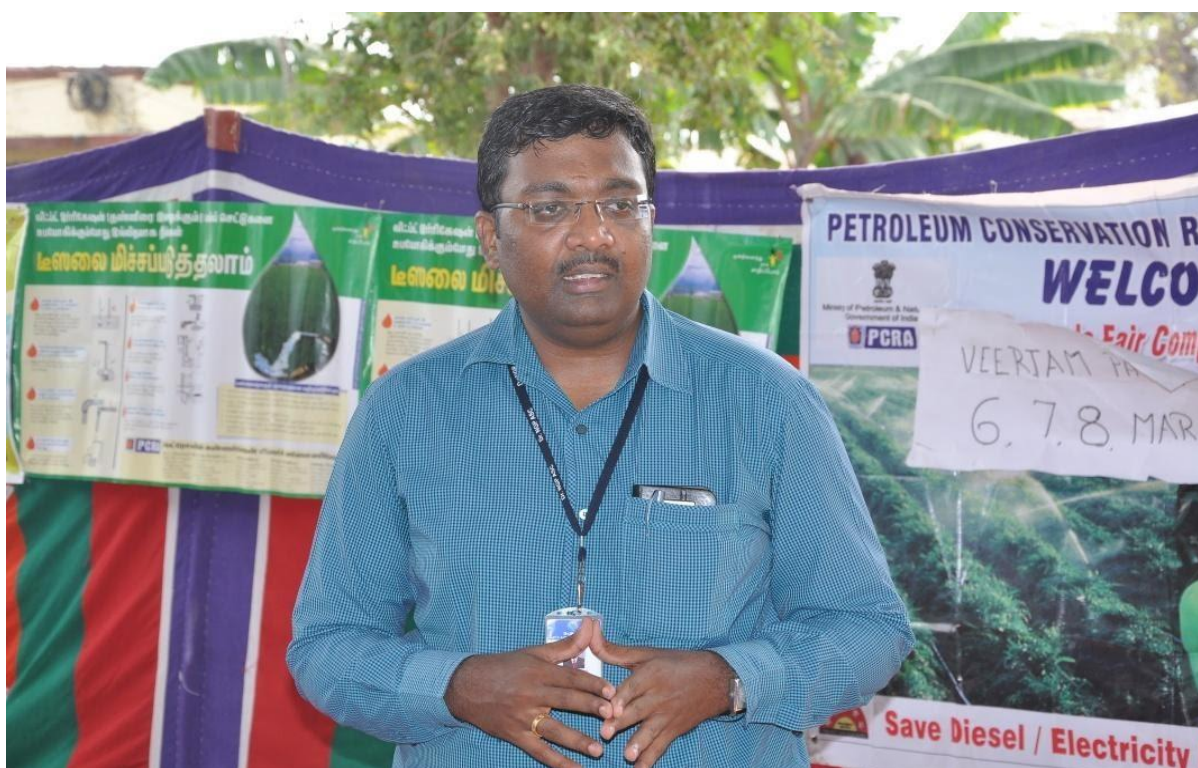
Kisan Mela- an Agricultural outreach program at Veerampalayam on 06.03.2017

Agriculture Program as outreach program was organized to give awareness on the agriculture-related technological developments to farmers and public of Veerampalayam village. 56 Students along with two staffs gave awareness on the above. The objective of the fair is to create awareness among farmers about the latest agriculture-related technological developments. Educating farmers on Diesel saving on tractor and pumps.