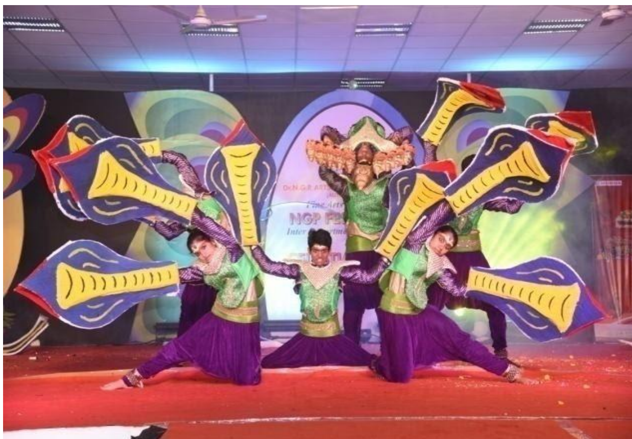
NGPFEST on 23.12.2016

The NGPFEST an Inter Departmental cultural fest is conducted every year from 2004 to motivate students to participate in an unbiased platform. A total of 10 off stage event and 3 onstage events will be conducted. The students of Computer Technology won the overall championship trophy for the year 2016-17. A cash prize of Rs. 36,000 was granted to the skilled NGPites.