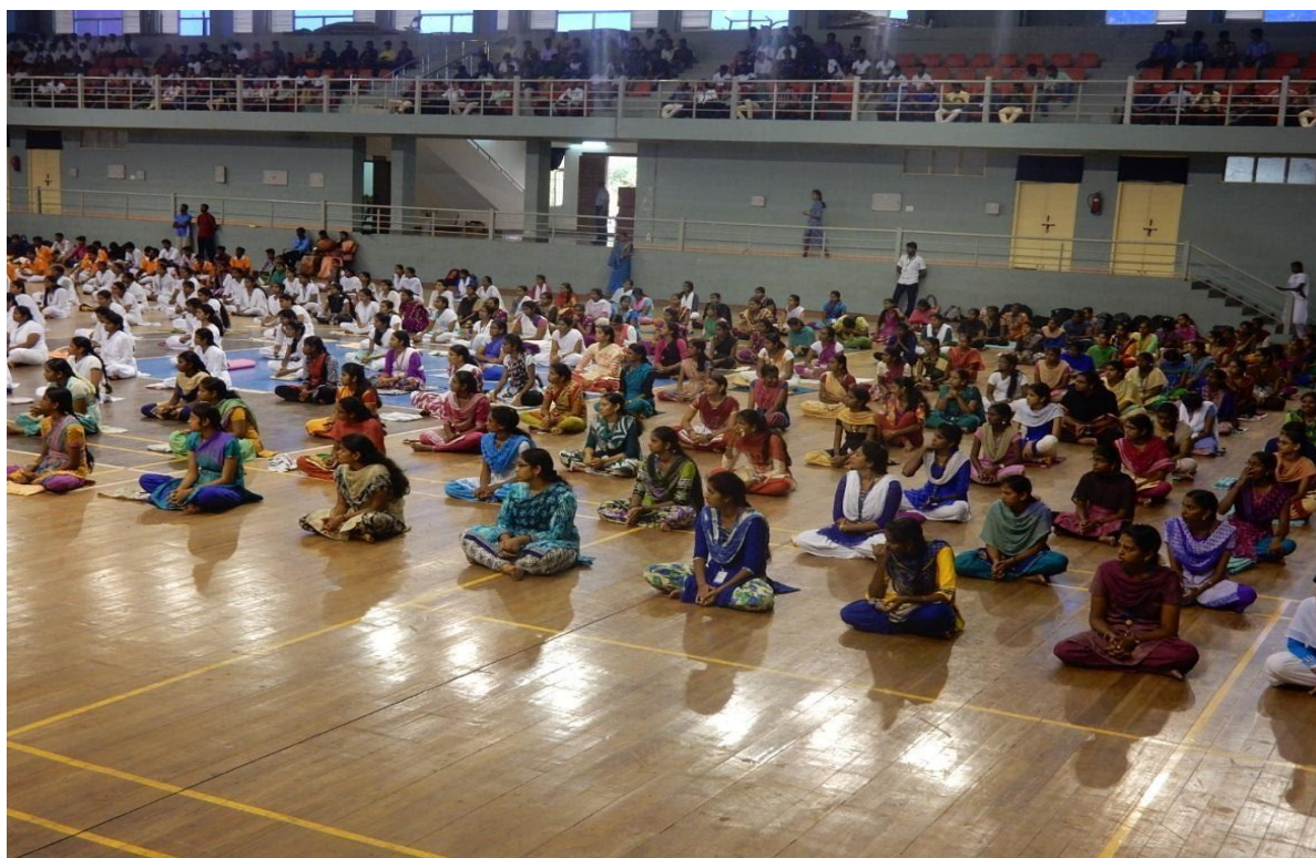
Mega Yoga Demonstration event conducted on 21.6.2016 at Bharathiar University