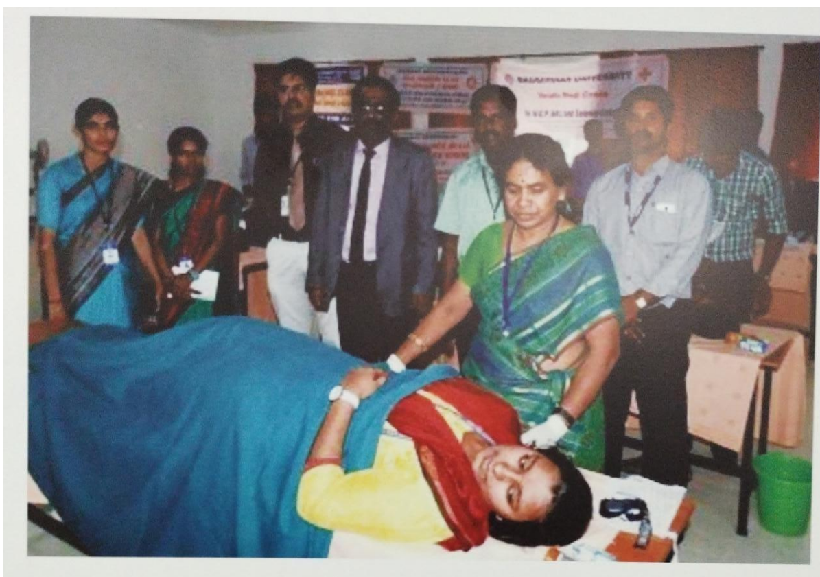
Blood Donation Camp on 12.12.2016

Blood Donation Camp organized by National Service Scheme (NSS), Red Ribbon Club (RRC), Blood Donors Club (BDC) and Youth Red Cross (YRC) in association with HDFC Bank, Coimbatore and Pollachi Government Hospital Blood Bank on 12.12.2016. The purpose of the programme is to do service to the sick and sufferings to the particular need of the blood group.