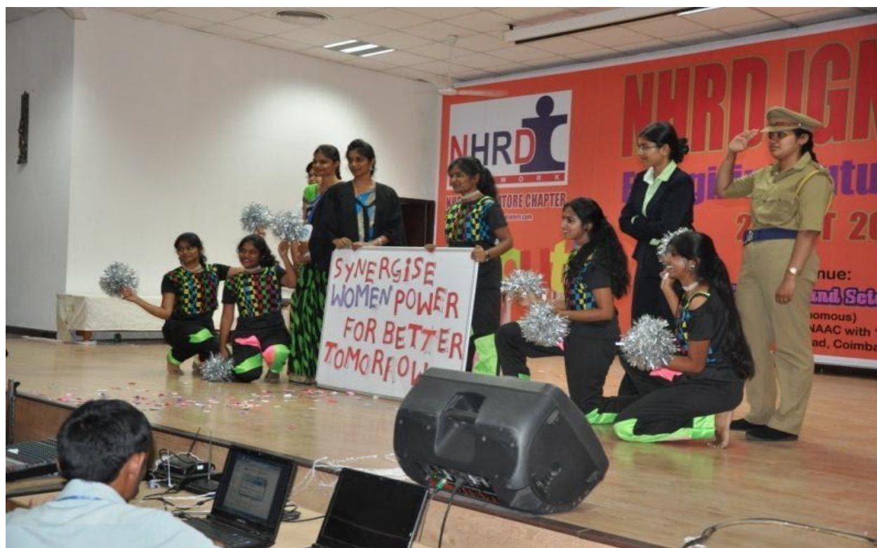
Mime Performance NHRD – IGNITE 2016 on 20.10.2016

A creative HRND network Apex body of professionals committed to promote the HRD movement in the country and enhancing the capability of human resource professionals to compete globally and thereby creating value for society. The NHRD – IGNITE 2016 was held on 20th October 2016 in our college. Various events like Business Innovation Contest, Quiz, Best Manager, Ad zap, Talent Show, Paper Presentation, Photography Contest, Short Film events conducted. our College students participated and won First Prize.